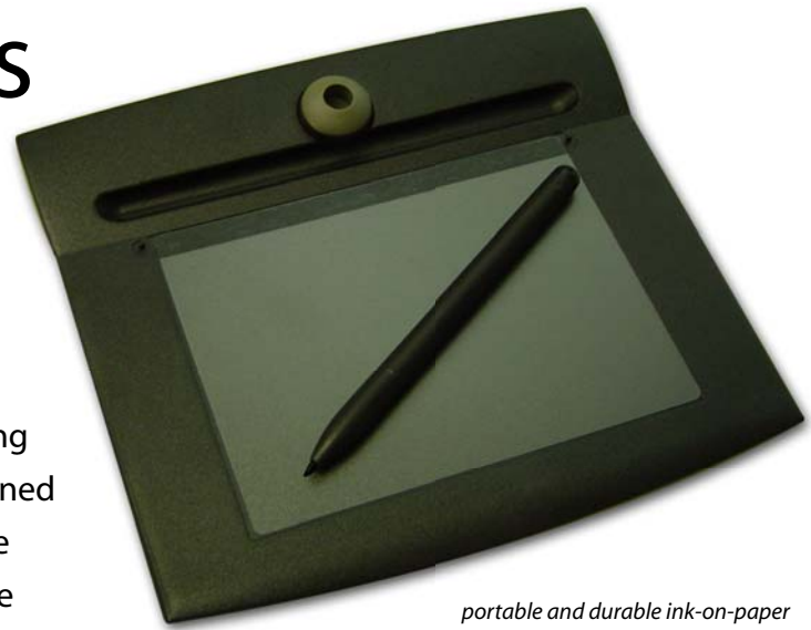
portable and durable ink-on-paper signature capture

characteristics. For a complete eSignature system, all Topaz tablets include a license to use Topaz's powerful software development tools, applications, and plug-ins with no additional fees.