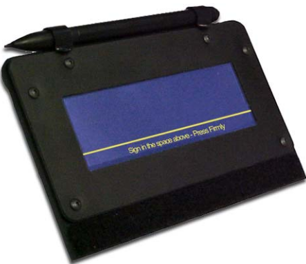
slim, portable touchpads for low-cost signature capture in the field.

SigAnalyze is a patented signature software tool allowing forensic examiners to analyze eSignatures. SigAnalyze displays a signature's image as well as objective information about the speed, timing, and order of individual strokes and points. By comparing eSignatures on a point-by-point basis, it can be determined whether or not a given signature record is authentic or a forgery.